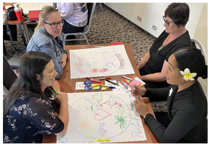
Lovely new images with a South Pacific flavour to depict THE Story we are part of.