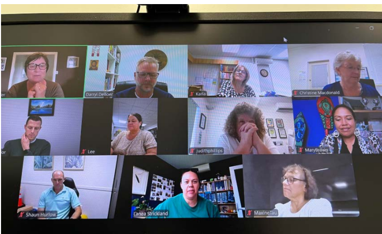
Zooming with School Leadership to talk about support for the Early Adopters at their schools.