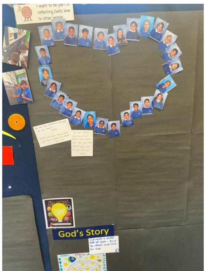
Early adopters are busy launching their Storyline and Storyboards as the school year begins.