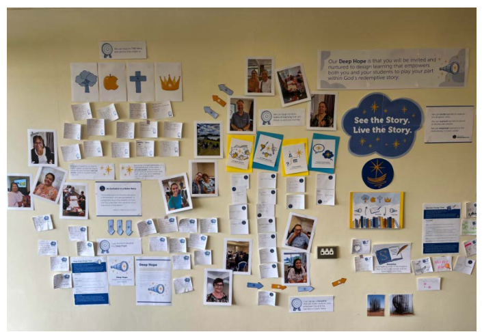
The Storyboard that emerged over the course of the 3 days of learning, singing and laughing together.

This is no ordinary group of early adopters!